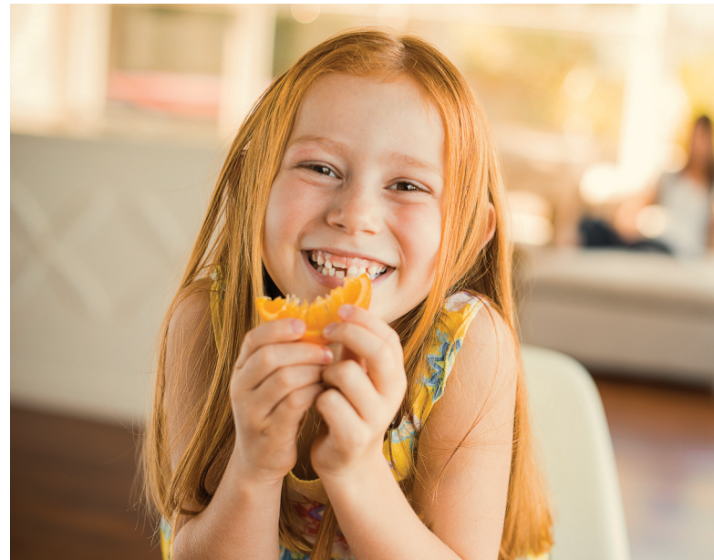
A young consumer enjoying a tasty New Zealand navel.