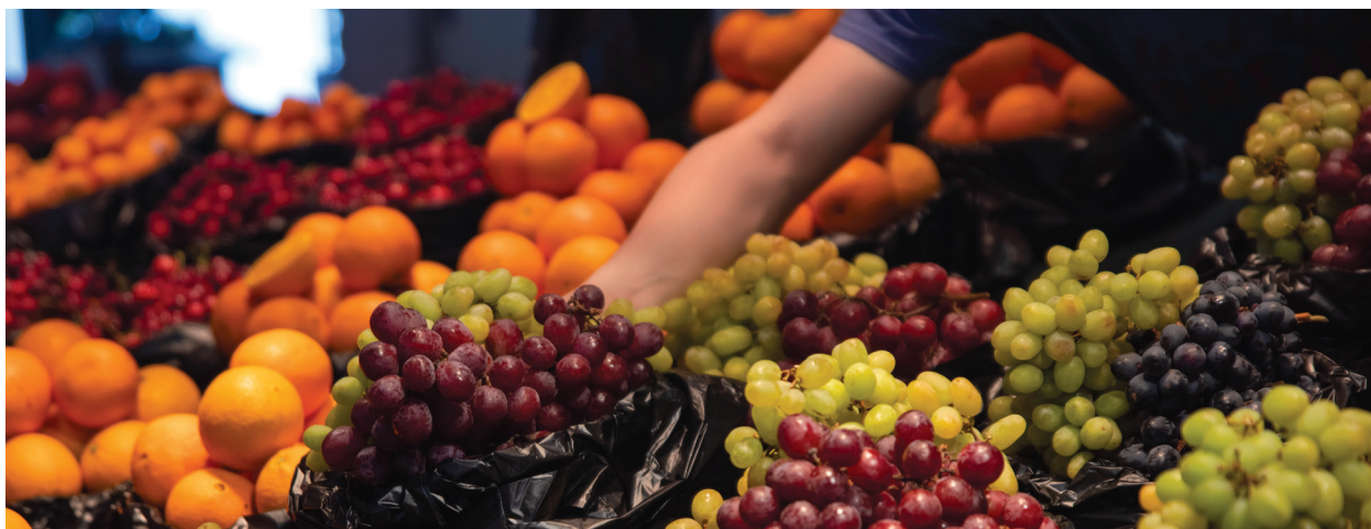
TABLE GRAPE FUND

Hort Innovation Strategic levy investment